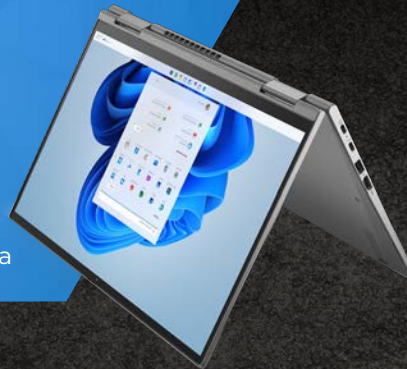
ThinkPad X1 Yoga

The Lenovo team can configure a Secured-core PC at the factory, ensuring your entire fleet is enabled consistently and accurately.