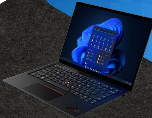
ThinkPad® X1 Carbon designed on Intel® Evo™ vPro® platform

of business leaders feel their cybersecurity risks are increasing. 7