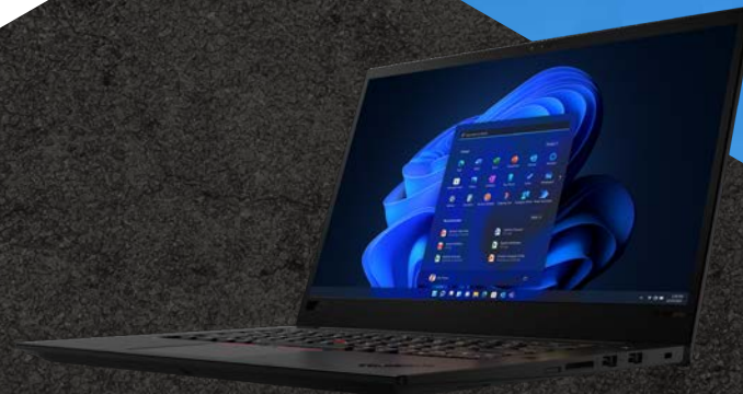
ThinkPad X1 Extreme