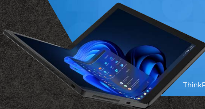
ThinkPad X1 Fold

Visit www.lenovo.com/FlexibleWorkforce and connect with a security specialist. We can help customize the right solution for your business.