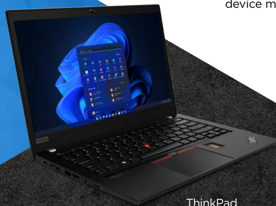
ThinkPad X13 i

Every step of the manufacturing process is controlled, audited, and tamper-proof from our facility to your employees' desks.