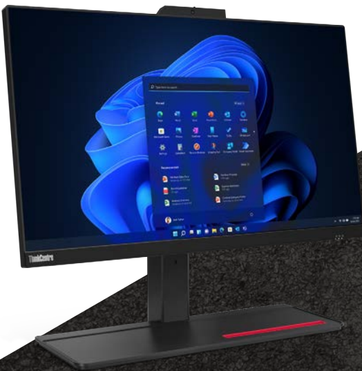
ThinkCentre M90a All-in-One

of respondents in a recent global survey indicated they were interested in a DaaS solution. 17