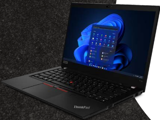
ThinkPad P14s i Mobile Workstation