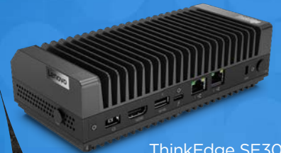
ThinkEdge SE30 designed on Intel vPro® platform

A secure gateway for protecting IoT devices against attack. All devices connected to the ThinkEdge SE30 benefit from ThinkShield protections.