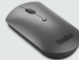
ThinkBook Bluetooth Silent Mouse PN: 4Y50X88824

The Lenovo Go Wireless ANC Headset with Teams Certification is designed to reduce ambient noise and maintain productivity while on the go. The USB-A Bluetooth receiver provides an outstanding connection. With Microsoft Teams Certification and cutting-edge noise cancellation technology, both office and remote workers will have the tools they need to tune out distractions and tune in to their work - all in one headset. This supports dual Bluetooth 5.0 and USB Audio connectivity for multitasking and advanced noise cancellation with ANC & ENC optimizes audio quality and talk-through. It features 1.5 hours of fast charging and up to 35 hours of playback time.