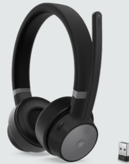
Lenovo Go Wireless ANC Headset PN: 4XD1C99222, 4XD1C99221 (w/o stand)

Designed for modern professionals, the Lenovo USB-C Universal Business Dock has everything that helps boost your productivity to the next level. With enhanced port expansion, optimum power delivery, and dual display support in a small space-saving, stylish exterior, the dock is the perfect companion for hybrid workspaces. With 11+ helpful expansion ports, optimizing your workspace and workflow has never been easier. It offers lightning-quick data transfers, dual 4K monitors, and rapid charging for notebooks up to 65W with the included adapter or up to 100W with the optional 135W adapter. It also supports one-click firmware updates even without Dock Manager.