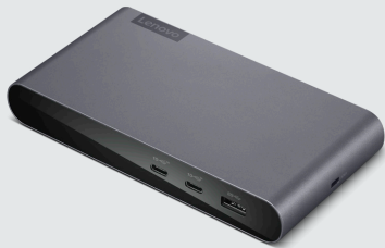
Lenovo USB-C Universal Business Dock PN: 40B30090xx

Designed for modern professionals, the Lenovo USB-C Universal Business Dock has everything that helps boost your productivity to the next level. With enhanced port expansion, optimum power delivery, and dual display support in a small space-saving, stylish exterior, the dock is the perfect companion for hybrid workspaces. With 11+ helpful expansion ports, optimizing your workspace and workflow has never been easier. It offers lightning-quick data transfers, dual 4K monitors, and rapid charging for notebooks up to 65W with the included adapter or up to 100W with the optional 135W adapter. It also supports one-click firmware updates even without Dock Manager.