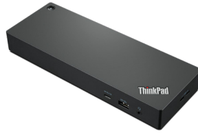
ThinkPad Workstation Thunderbolt™ 4 Dock