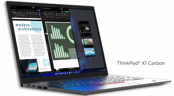
ThinkPad® X1 Carbon

Lenovo recommends Windows 11 Pro for Business.