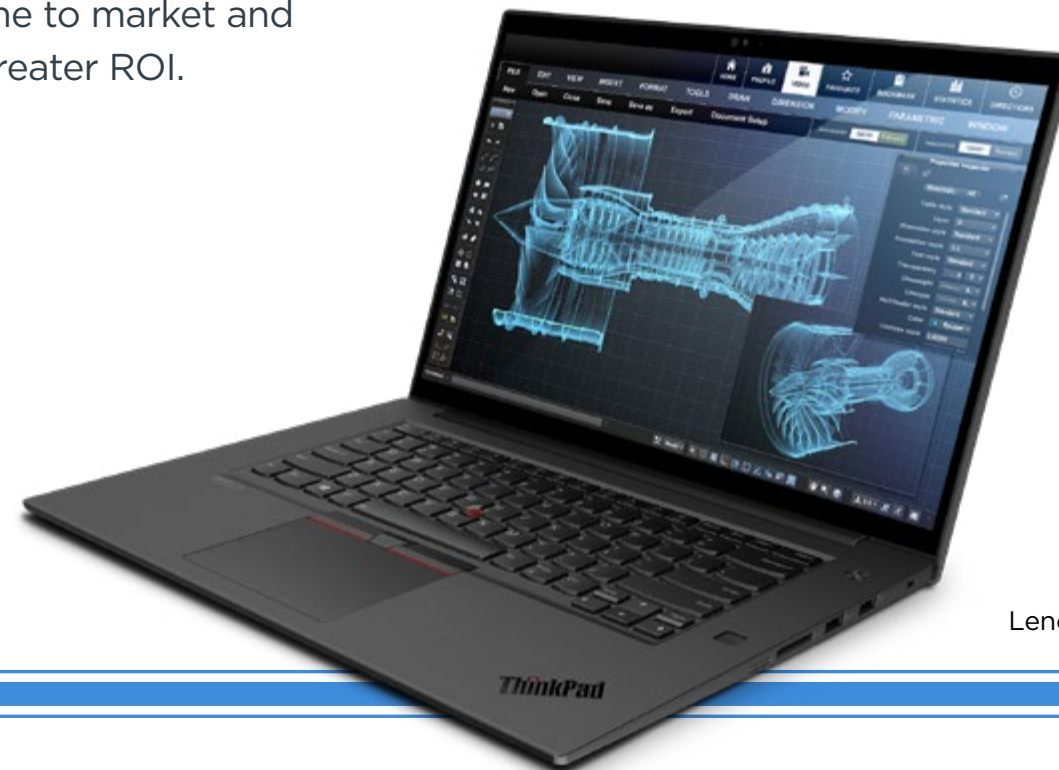
Lenovo ThinkPad P1

Ultimately, that speed means faster time to market and overall greater ROI.