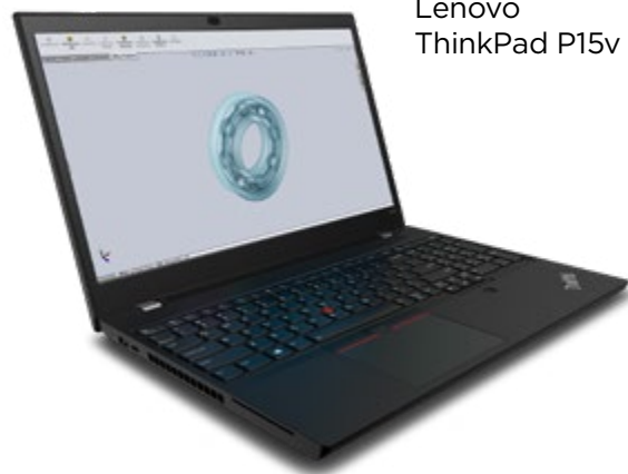
Lenovo ThinkPad P15v

LENOVO WORKSTATIONS ARE #1 FOR RELIABILITY AND UP TO 20% MORE RELIABLE THAN THEIR COMPETITORS 2