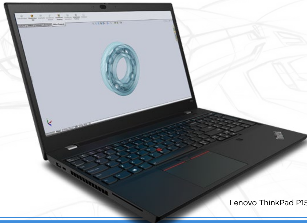
Lenovo ThinkPad P15

And, significantly, a commonality of design goals and language.