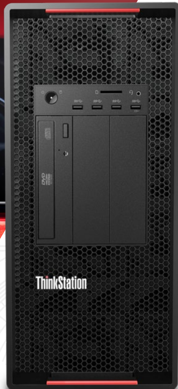
Lenovo ThinkStation P920

Both organizations are obsessed by design. Superb styling is what the customer sees – brilliant design makes it possible.