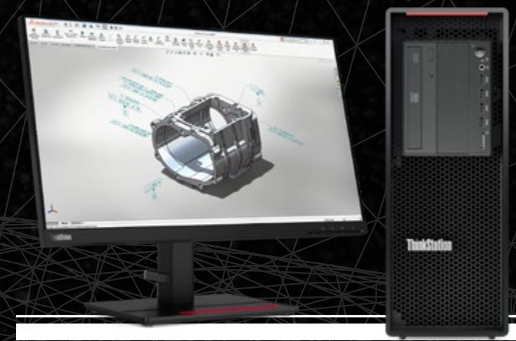
Lenovo ThinkStation P520 with ThinkVision P24q Monitor