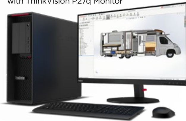
Lenovo ThinkStation P620 with ThinkVision P27q Monitor

Combine a mobile workstation with TGX Remote Workstation Software and teams can share powerful, high-end host workstation resources across the business.