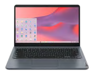
Lenovo 14e Chromebook Gen 3 (Includes NetFilter and LanSchool)