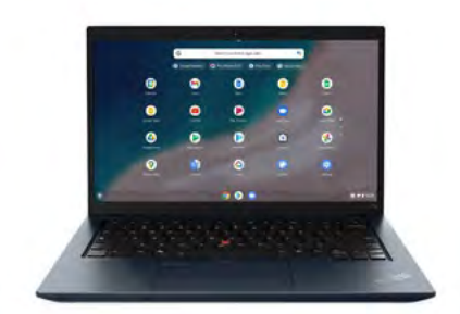
Lenovo ThinkPad C14 Chromebook Powered by Intel (Includes Parallels instead of NetFilter)

This bundle is designed to help teachers fully utilize the latest technology of their Lenovo Chromebooks and create interactive and engaging lesson plans, manage their classrooms effectively, and access professional development resources. This bundle will allow teachers to get the most out of their Lenovo Chromebooks and improve the learning experience for their students. Teachers can contact their Lenovo representative for more information and to purchase this bundle.