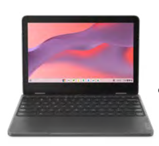
Lenovo 300e Yoga Chromebook Gen 4