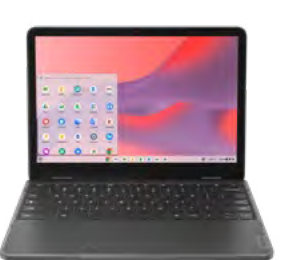
Lenovo 500e Yoga Chromebook Gen 4