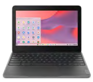
Lenovo 100e Chromebook Gen 4