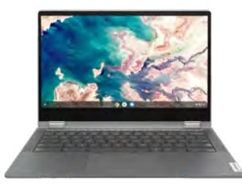
Lenovo Flex 5i Chromebook