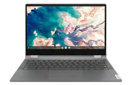
Lenovo Flex 5i Chromebook (Includes Parallels instead of NetFilter)