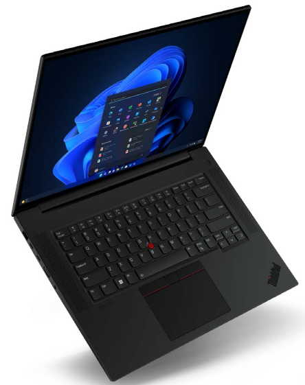
ThinkPad P series

Provision Lenovo devices running Windows 11 Pro, for greater peace of mind, using Windows Autopilot zero-touch deployment. Employees simply unbox their device and start working.