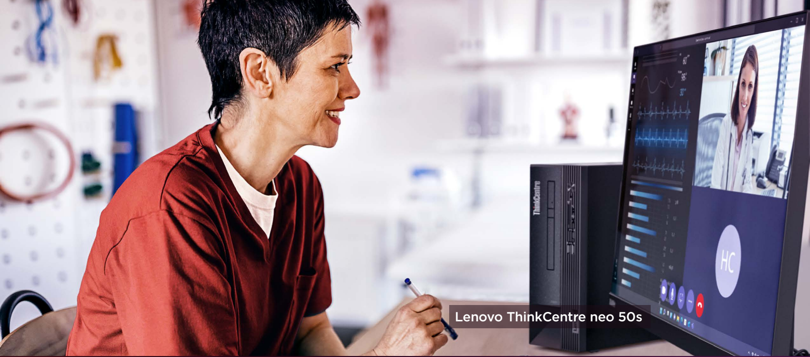
Lenovo ThinkCentre neo 50s