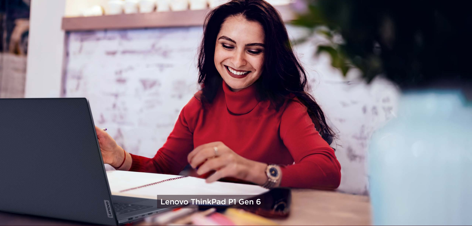
Lenovo ThinkPad P1 Gen 6