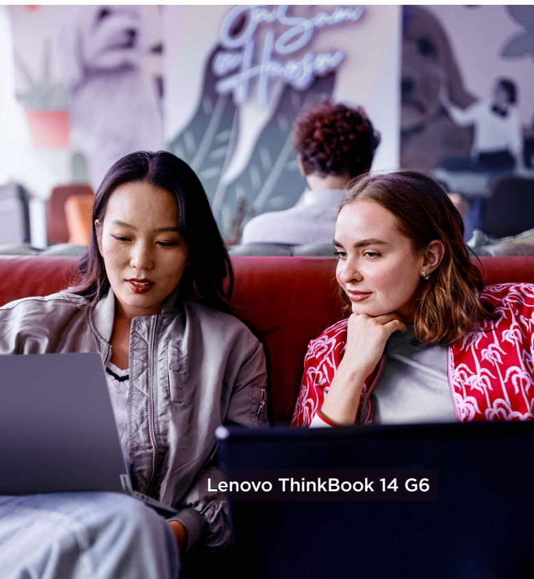
Lenovo ThinkBook 14 G6