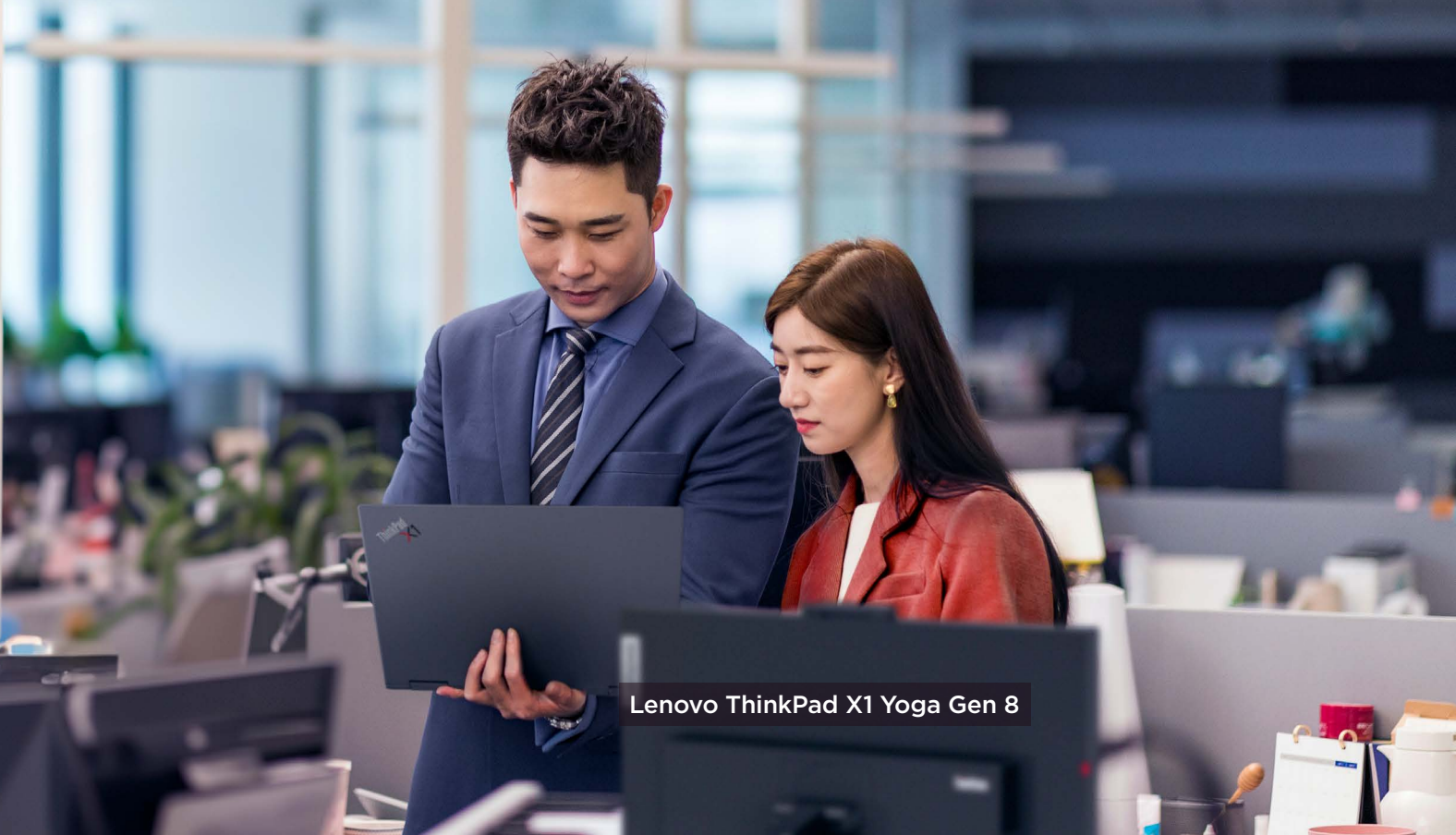
Lenovo ThinkPad X1 Yoga Gen 8