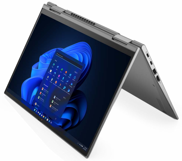
Lenovo ThinkPad X1 Yoga

Get up and running quickly with security built in and added to your technology from the start. The latest Lenovo ThinkPad and ThinkBook devices , running Windows 11 Pro , have security defenses in place, ready right out of the box.