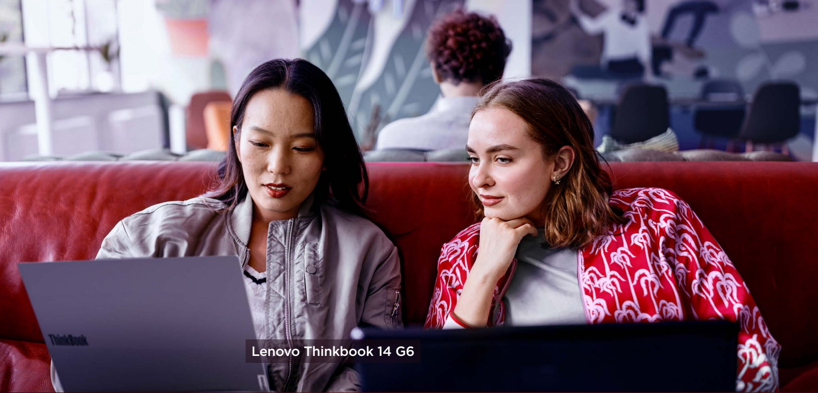
Lenovo Thinkbook 14 G6