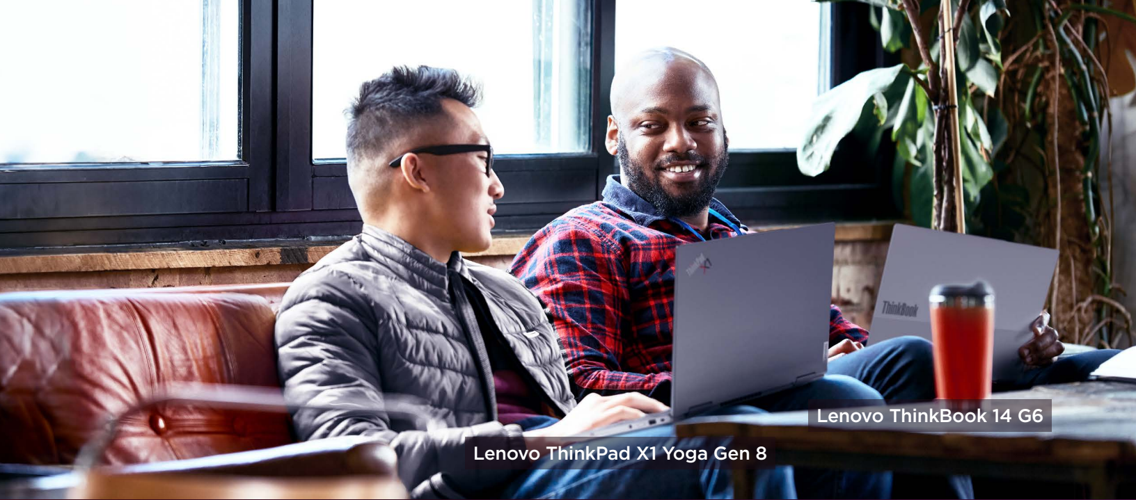
Lenovo ThinkPad X1 Yoga Gen 8