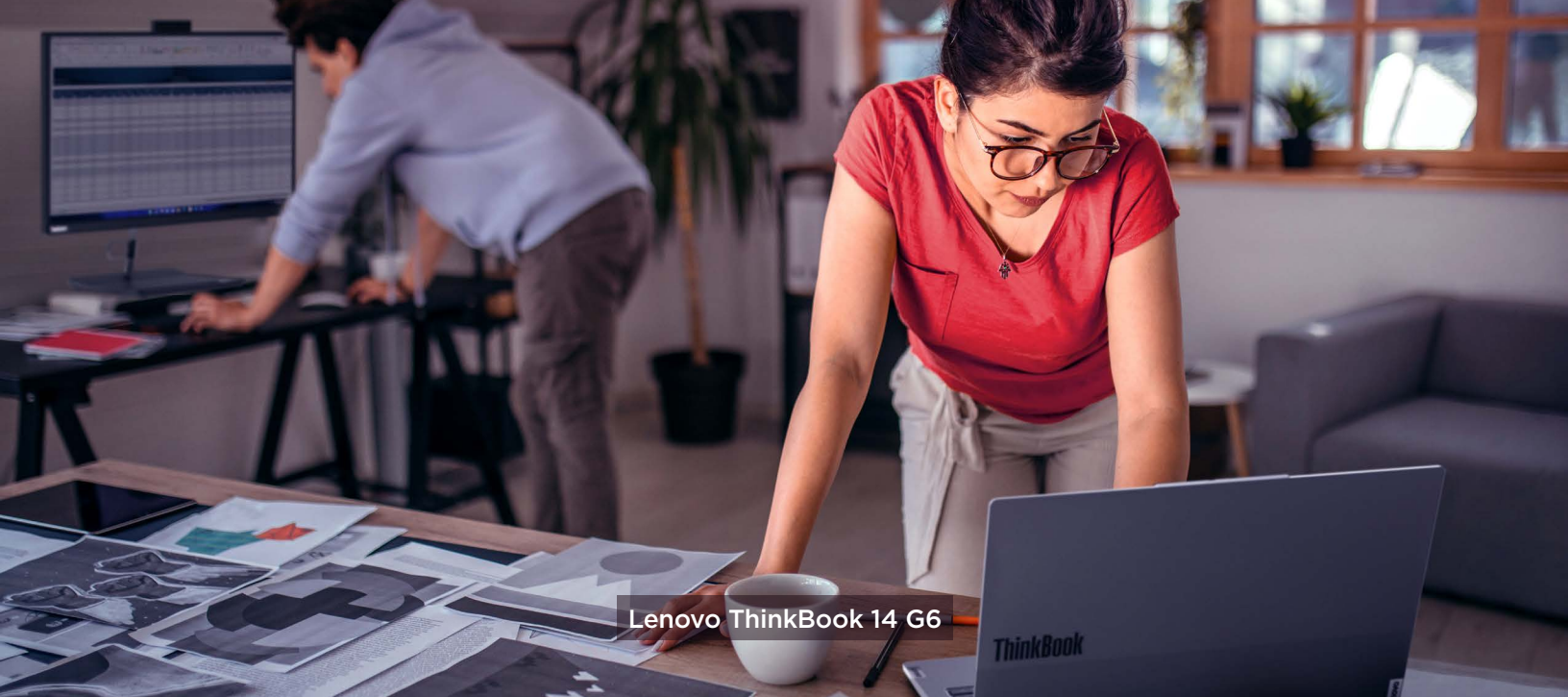
Lenovo ThinkBook 14 G6