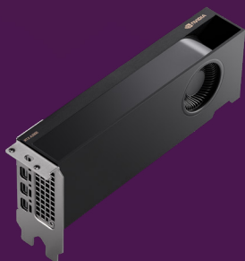
NVIDIA RTX™ A2000 Graphics Card