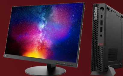
Desktops and All-in-Ones